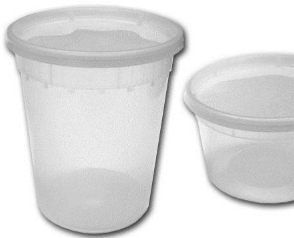
Heavy Duty Injection Mold Deli Cups