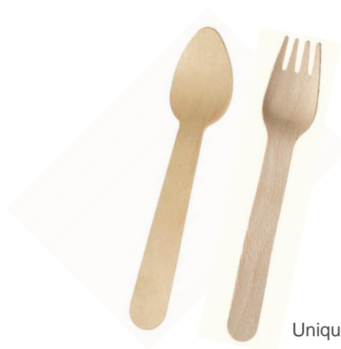
Unique wood cutlery